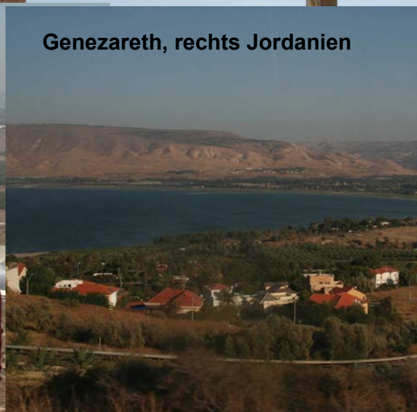
Genezareth, rechts Jordanien