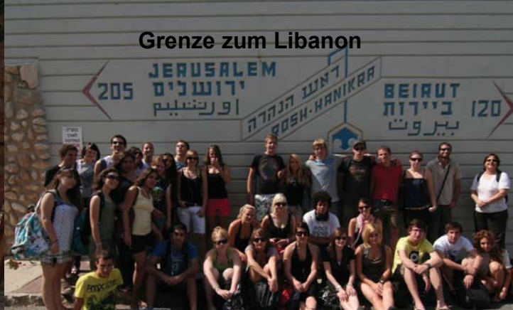
Grenze zum Libanon